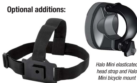
Halo Mini elasticated head strap and Halo Mini bicycle mount